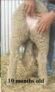
10 months old

A gentle giant, who is one of a kind, with extreme virtues. Born as a quad via natural mating, displaying incredible early maturity, tipping the scales at 126.5kg at 12 mo., 3 weeks age; as well as the following; A brilliant temperament; make & shape; balanced sheep; bare breach (sc 2); white, deep crimping wool; fertility; Purity of face; feet & exceptional bone. His impact on fertility, NLW is his biggest virtue. Ox has been entered in sire evaluations and uses as a link sire. He continues to be a trait leader in many traits, including ratio of tops to culls. Semen sold across the country to horn and poll studs.